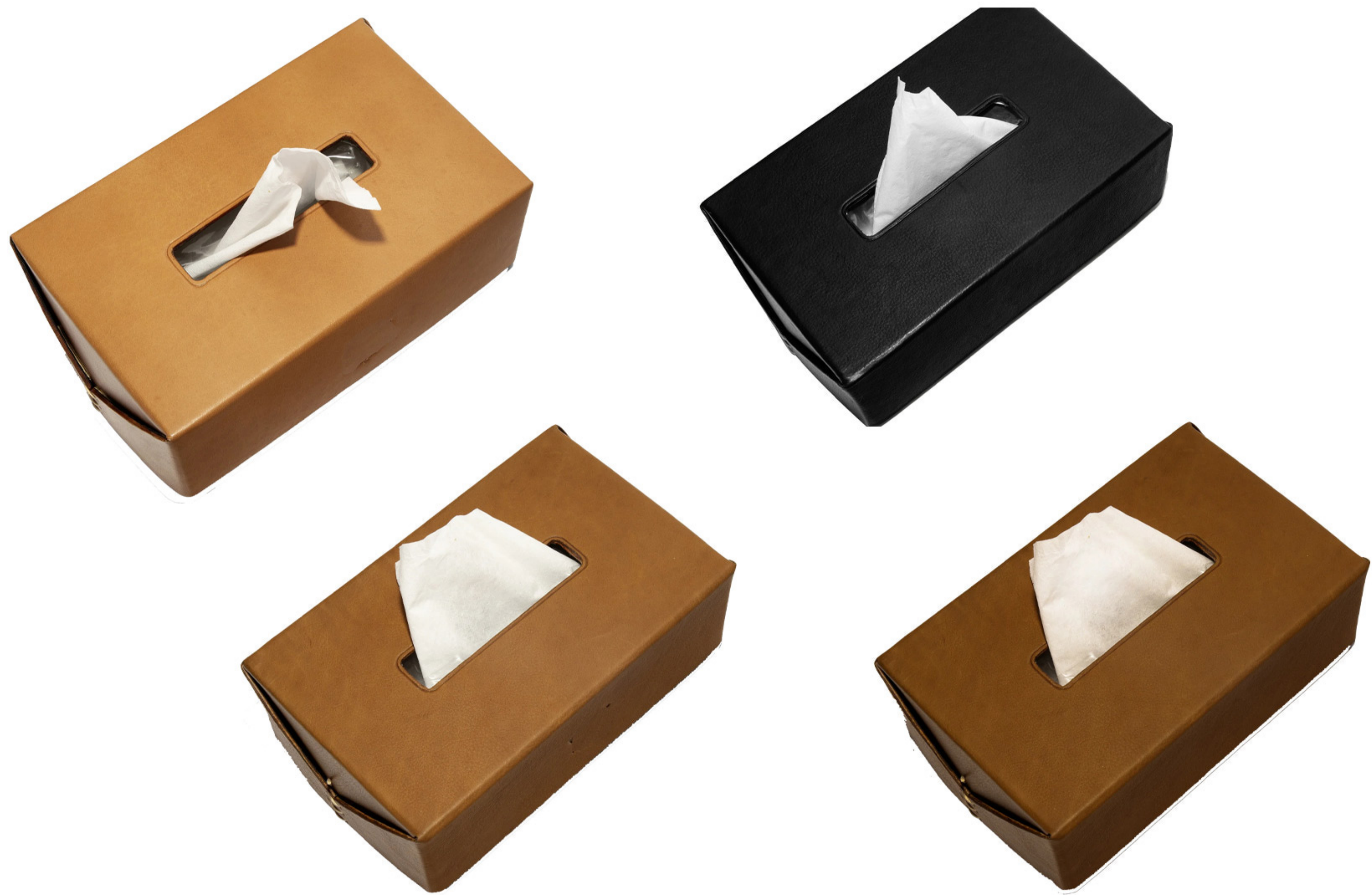
RECTANGULAR TISSUE BOX